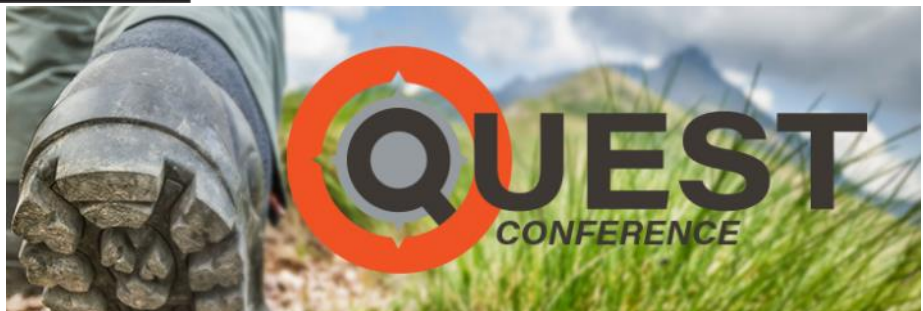
VOLUME 5 A MAN AND HIS MARRIAGE