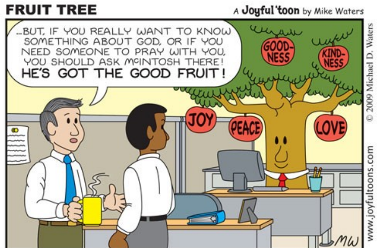
The fruit of the righteous is a tree of life, and he who wins souls is wise. — PROVERBS 11:30 NIV